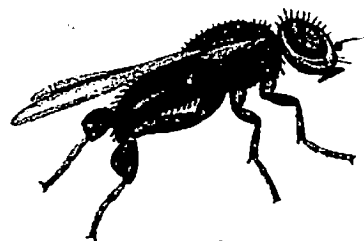
Leptommetopa latipes (Meigen, 1830)

Diagnosis. Small to very small, greyish black or shining black flies, sometimes with conspicuous silvery dusting. Lower fronto-orbital setae inclinate (sometimes reduced or absent); upper fronto-orbital setae proclinate or curved outwards. Costa with humeral and subcostal breaks; subcosta entire, but sometimes very thin. Tibiae without preapical setae. Ocellar triangle well developed. Proboscis often elongate; palpi large to very large and setose; vibrissae present, often very thin.