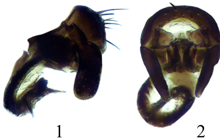
Figs 1–2. Meoneura thaica sp. n., holotype male: 1) epandrium, cercus and surstylus, lateral view; 2) epandrium, cerci and surstyli, dorsal view.

shining. Scutum shining rather than subshining, pleural sclerites subshining. No dorsocentral setae. Scutellum microtomentose. Wing hyaline. Knob of halter yellow, stalk blackish. Abdomen subshining. Epandrium with one pair of epandrial processes only (surstyli). Surstylus simple, straight and wide in lateral view (Fig. 1).