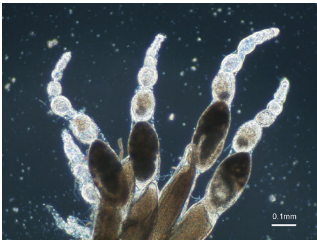
Fig. 1 Detail of the morphology of the reproductive system of female C. hemapterus . Several ovarioles with follicles at different degree of maturity can be seen. The least mature follicles are formed at the distal part of the ovariole (germarium). Follicles become mature (i.e. larger) as we move away from the germarium, so that mature, chorionated follicles can be observed at the lower part of the picture

As estimators of body size, length, and maximum width of abdomen and thorax of each female was measured prior to