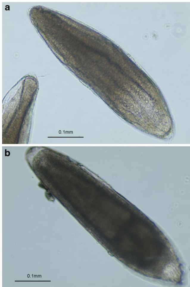
Fig. 2 C. hemapterus eggs. Mature, chorionated, unladen egg (a) and laid egg (b)

Chorionated eggs, averaging 34.4 \pm 3.6 per laying female (range, 6–64) were similar in size to laid eggs (Fig. 2).